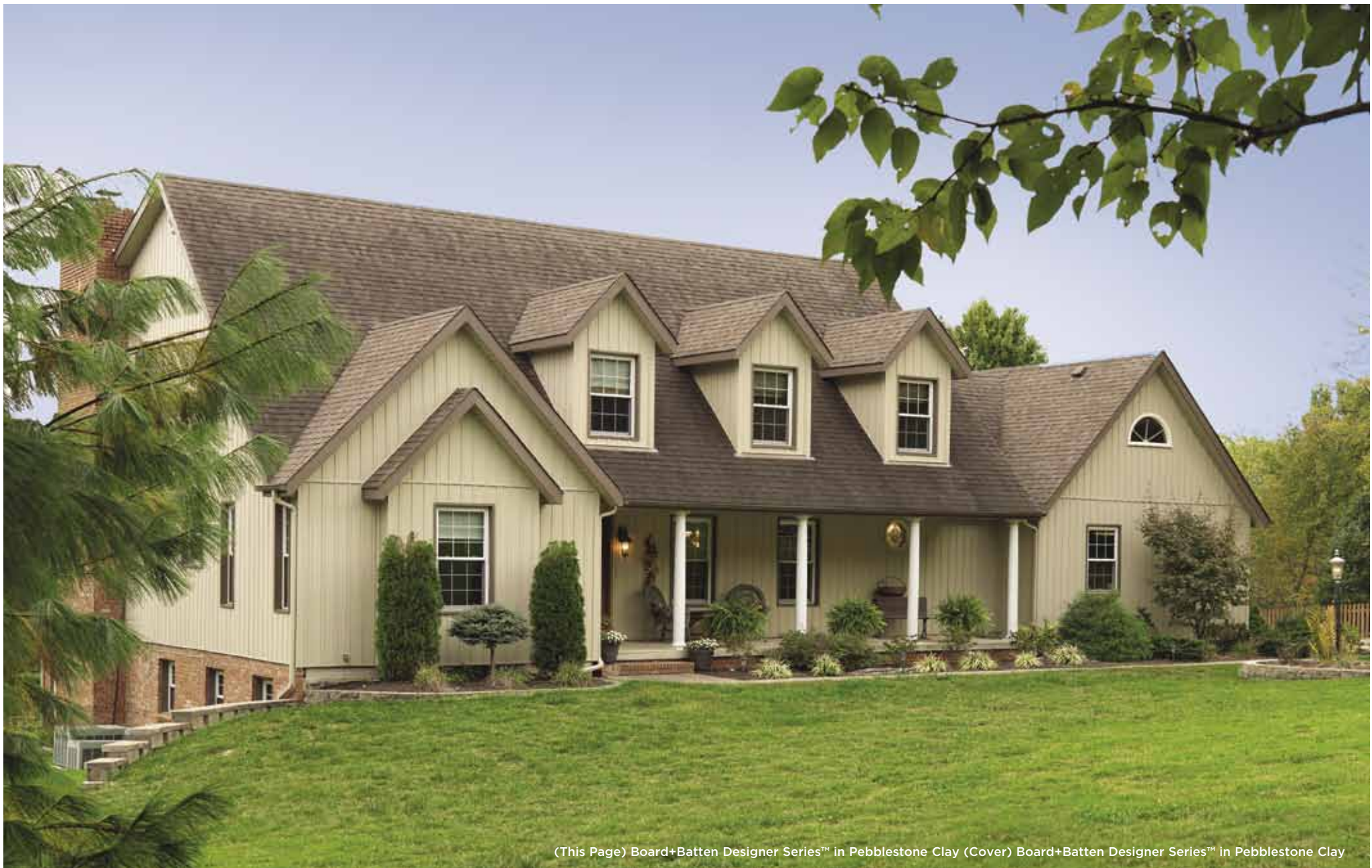
(This Page) Board+Batten Designer Series™ in Pebblestone Clay (Cover) Board+Batten Designer Series™ in Pebblestone Clay

Board+Batten Designer Series™ delivers striking style in a vertical panel. Use it as the dominant exterior cladding or as an accent to highlight architectural features. Available in a broad range of colors, including new darker hues for a contemporary look, it never needs painting. Advanced engineering ensures superior impact resistance and outstanding durability in all weather conditions.