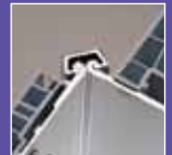
The continuous fixed geared hinge has been certified to be fully functional after 1.5 million opening and closing cycles.**