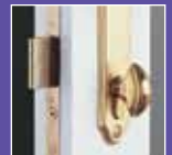
A solid brass center deadbolt and keyed lock provide maximum protection.